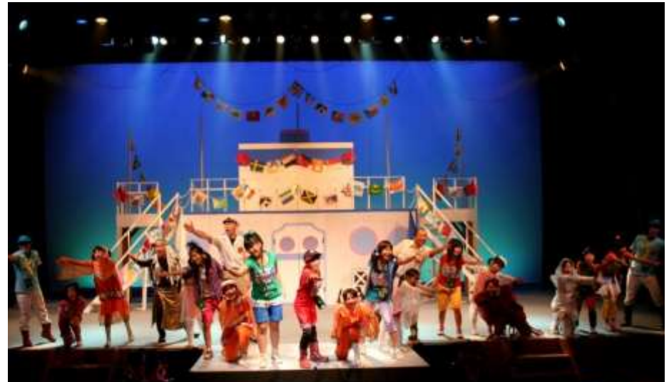
"TO TOMORROW" (Theme on Sea)