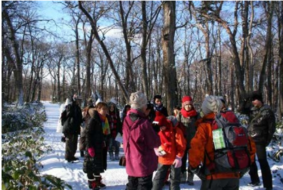
Nopporo Forest Park (Hokkaido)

Feature of our musical ◆ We go to various nature conservation areas to obtain experiences and feel nature to help making musical stories.