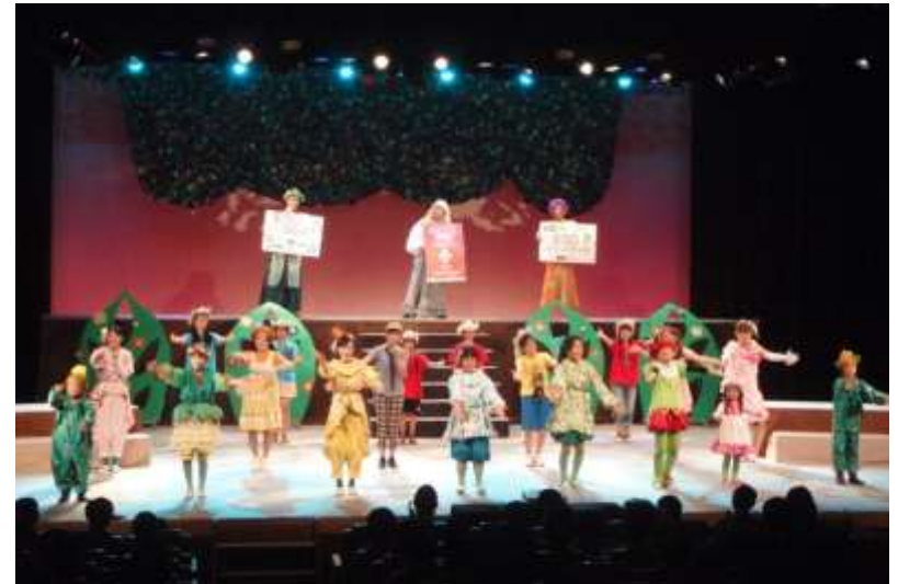
Performing at the theater