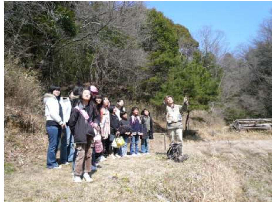
Toyota Nature Observation Forest (Aichi)

We went to National parks and Wildlife sanctuaries.