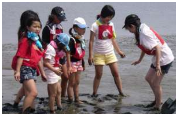
Fujimae tidal flat (Aichi)

Feature of our musical ◆ We go to various nature conservation areas to obtain experiences and feel nature to help making musical stories.