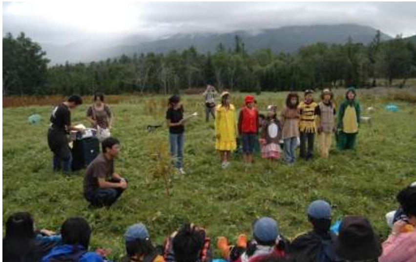
"Dozira, a monster, and missing children in Shiretoko" (Theme on Forest)