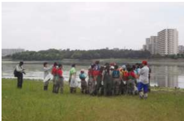
Yatsu tidal flat (Chiba)

We participated in wetland activities of Japanese Ramsar Sites: