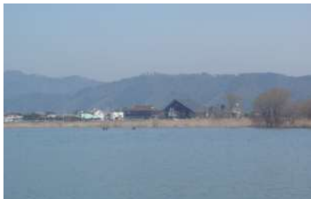
Lake Biwa (Shiga)