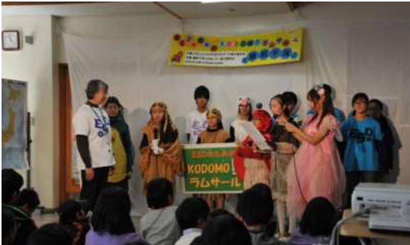
Donation for an NGO's nature conservation activity

Member ◆ 25 members with a wide age group ranging: 5 - 59 years old ◆ To make musicals, members' opinions are fully reflected.