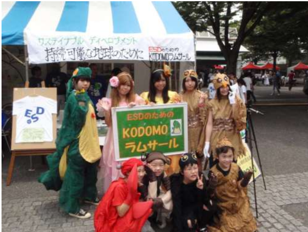
KODOMO Ramsar for ESD kickoff event at Eco-life fair 2011