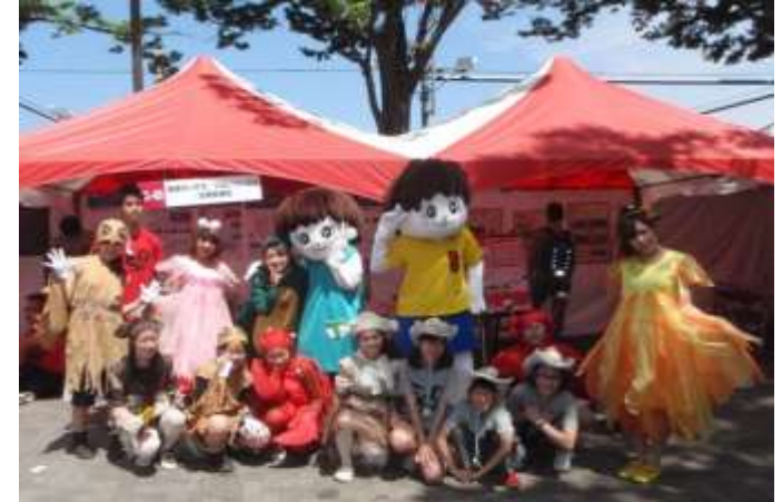
KODOMO Ramsar for ESD in Eco-life fair 2013