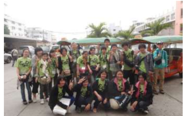
KODOMO Ramsar for ESD in Nakhonsawan, Thailand